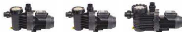
Type 1 Type 2 Type 3

All types 230 V / 50 Hz. Special voltages available on request.